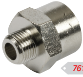
7612 1/8" M / 1/4" F BSP £1.55