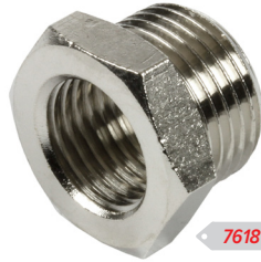
7618 3/8" M / 1/4" F BSP £1.51