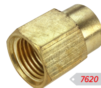
7620 1/8" F / 1/4" F BSP £2.02