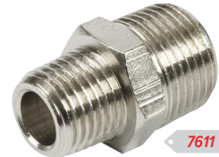
7611 1/4" M / 3/8" M BSP £2.43