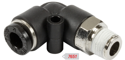
7651 6mm / 1/8" BSP M £2.99