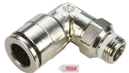
7654 8mm / 1/8" BSP M £3.23