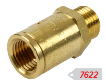
7622 1/4" BSP M / F £28.52

Used on Blow Guns, such as 2870, to reduce the pressure to a safer 40 PSI. 17mm dia.