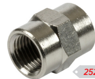
2524 1/4" F / 1/4" F BSP £1.44