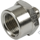
7613 1/8" M / 3/8" F BSP £3.81