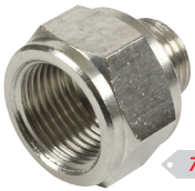
7614 1/4" M / 3/8" F BSP £3.18