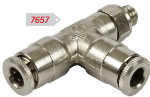
7657 4mm / 4mm / M5 BSP M £6.02