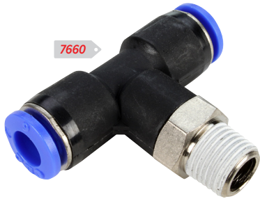
7660 6mm / 6mm / 1/8" BSP M £4.73

The body is rotatable around the brass stud end.