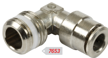
7653 6mm / 1/4" BSP M £7.48