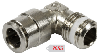
7655 8mm / 1/4" BSP M £7.48