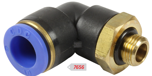
7656 10mm / 1/8" BSP M £4.26