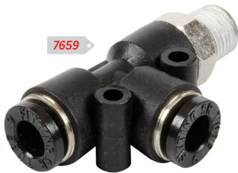
7659 6mm / 6mm / 1/8" BSP M £4.64