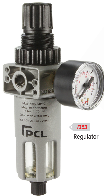
1353 Mini Regulator £53.75