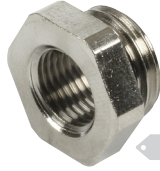
7616 1/4" M / 1/8" F BSP £1.23