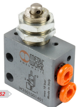
7662 4mm / 4mm £23.48