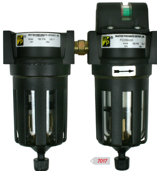
7017 Coalescent Moisture Filter £203.52

The oil and water removed are retained in the filter and should be drained each week. We can advise on the correct component set and fitting procedure.