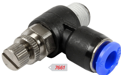
7661 6mm / 1/2" M BSP £12.04

Helps regulate the speed of pneumatic cylinders and other devices.