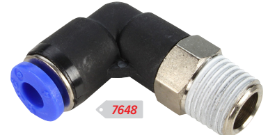
7648 4mm / 1/8" BSP M £2.54