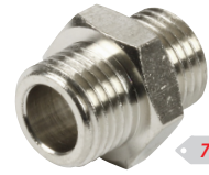
7608 1/4" M / 1/4" M BSP £2.62