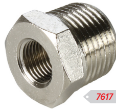
7617 3/8" M / 1/8" F BSP £1.66