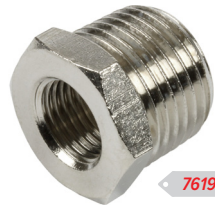
7619 1/2" M / 1/4" F BSP £2.52