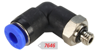
7646 4mm / M5 BSP M £3.01