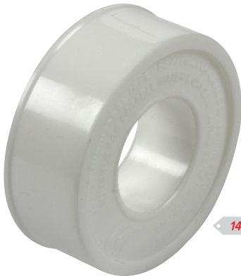
1478 PTFE Sealing Tape 12mm x 12m £ 1.11

Polytetrafluoroethylene (PTFE) tape is used to create an airtight seal on thread joints.