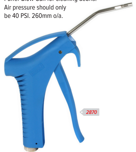
2870 CEJN Blow Gun £19.08

Air pressure should only be 40 PSI. 260mm o/a.