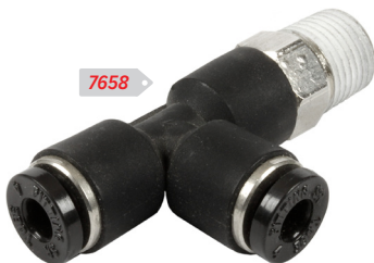
7658 4mm / 4mm / 1/8" M BSP £4.64