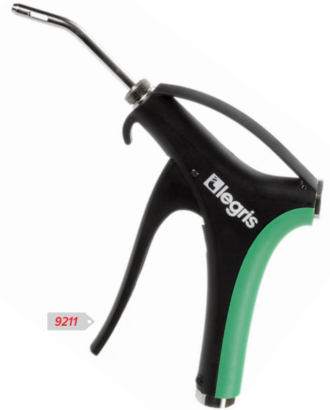
9211 LEGRIS Blow Gun £35.14

Air pressure reducing valve built-in. For clearing debris. Handy hanging hook and replaceable nozzle. 235mm o/a.