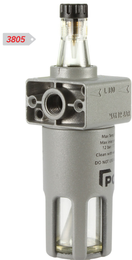
3805 Lube Oil Drip Feed £46.52