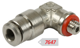
7647 4mm / M5 BSP M £6.24

Push-in tubing connection at a 90° angle.