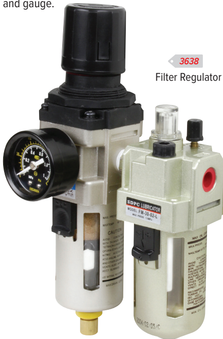
3638 Mini Water Filter / Regulator £95.00

Mini water filter to reduce moisture and contaminants from the air flow, with a regulator and gauge.