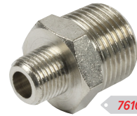
7610 1/8" M / 3/8" M BSP £2.41