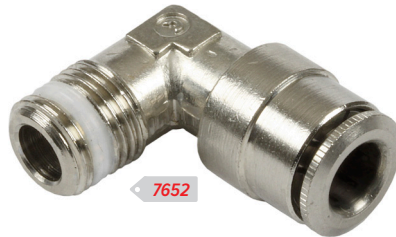
7652 6mm / 1/8" BSP M £6.60